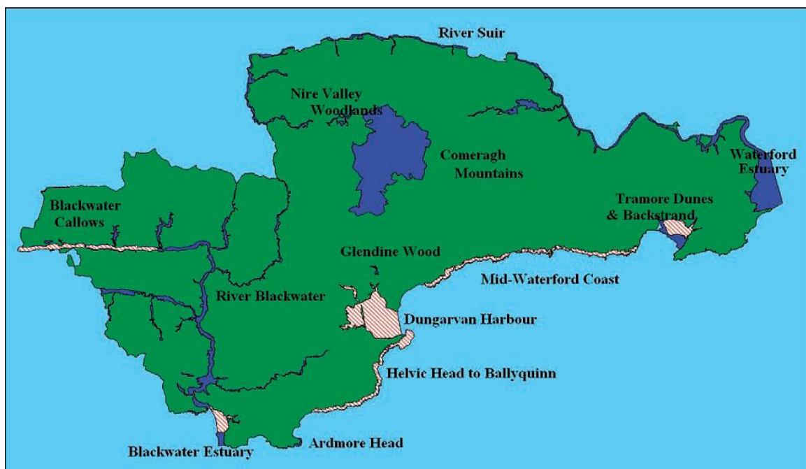
Figure 9.1 SACs and SPAs in Waterford.