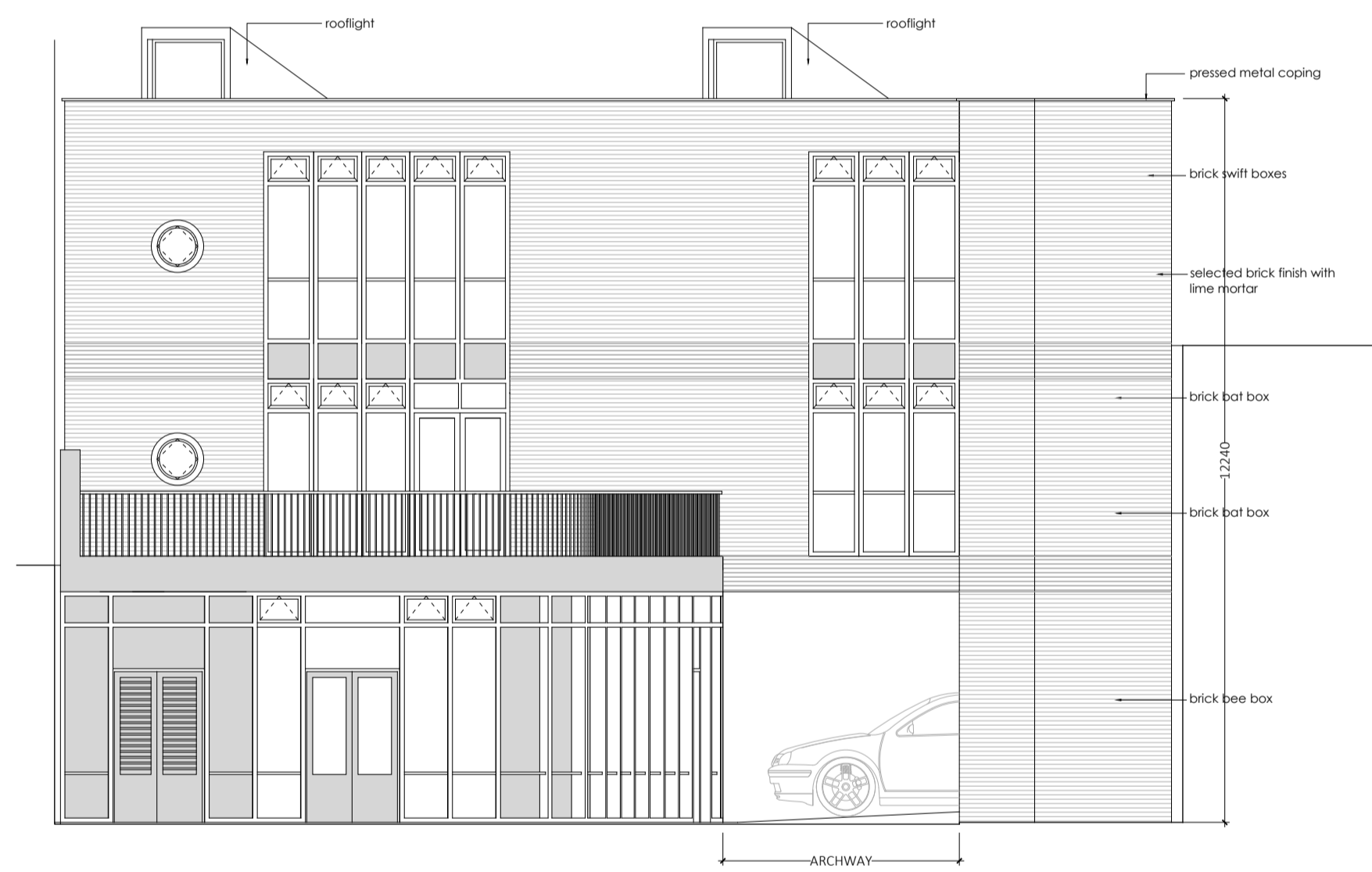
SECTION AT B-B' (REAR ELEVATION)