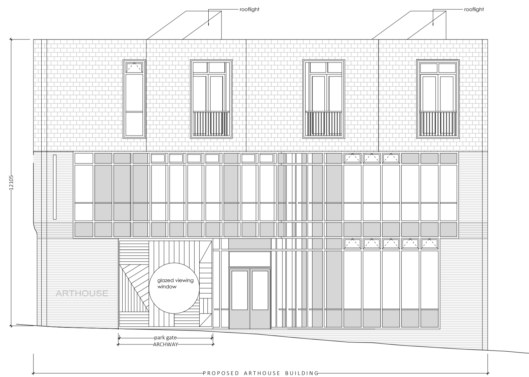
FRONT FACADE with park gate closed