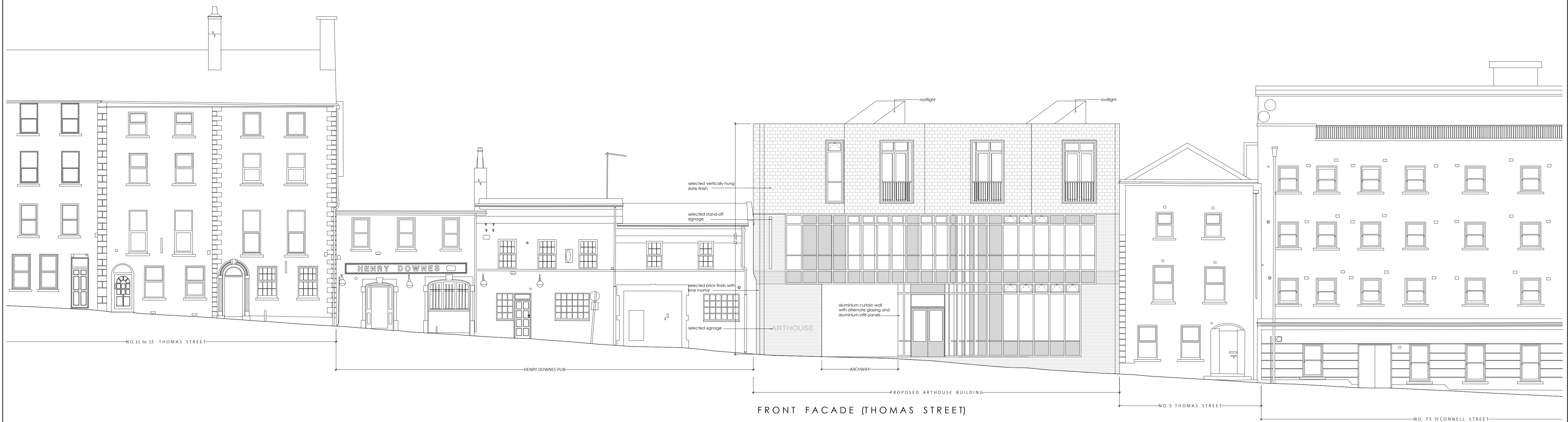
FRONT FACADE (THOMAS STREET)