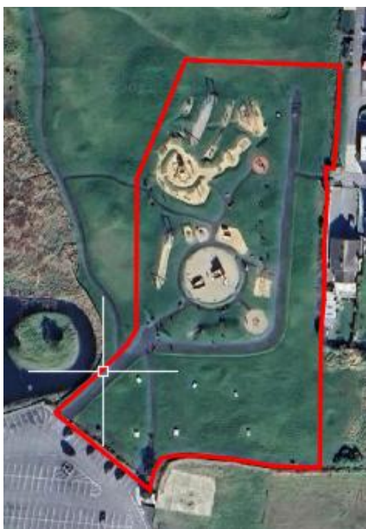
Fig 1: Existing Site Location with Proposed Site Boundary

The red line site area subject to this Part VIII proposal is 10,905m 2 /1.091ha.