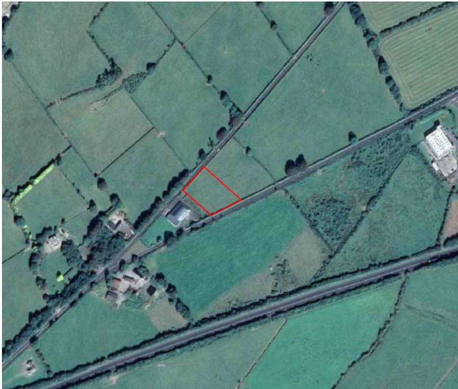
Fig 1.1 – Proposed location