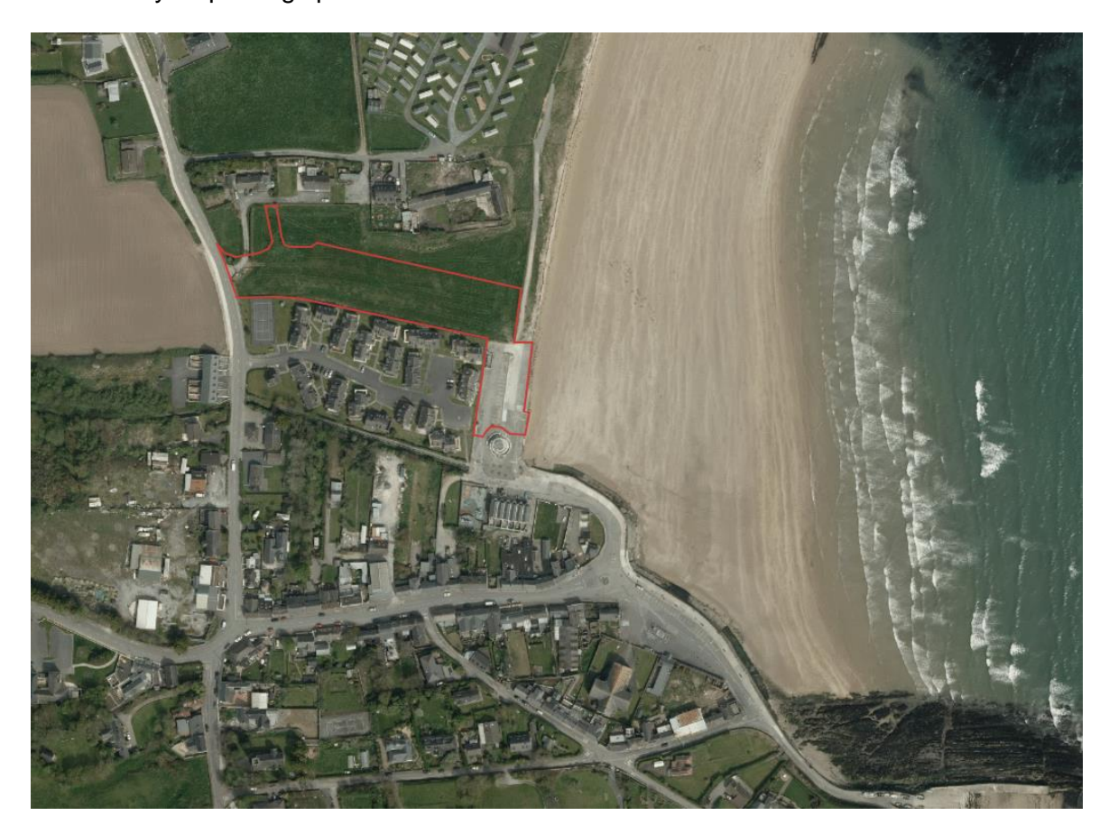
Fig.1: Aerial image of Site Location and Red Line Boundary.

The nature and extent of the proposed works, as described in the public and site notice is as follows: