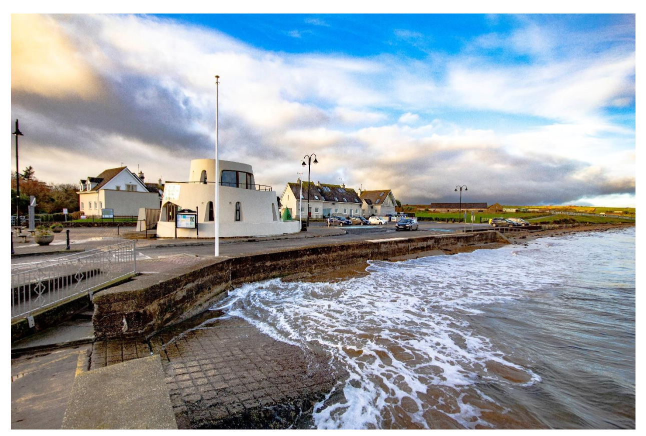
Fig.2: Photo of the site from the southeast.