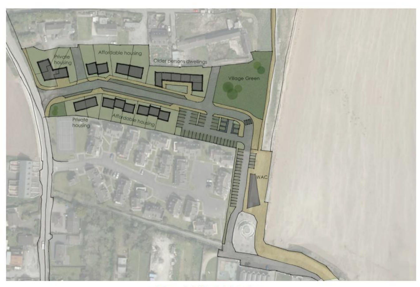
Ardmore Relief Road sketch scheme

The following sketch represents a very preliminary view of the nature of development that this Council would envisage at the location. I would emphasise that this is preliminary, and we would be consulting with the community through The Town Centre group and public meetings on the exact configuration. Delivery of such a development would be subject to Council ownership of the lands and ultimately be subject to approval of the elected members while the conditions of disposal of any future houses would also be subject to Council approval. In our view the delivery of such a development is not viable through normal market forces and without the support of the Rural Regeneration Fund for the provision of core infrastructure.