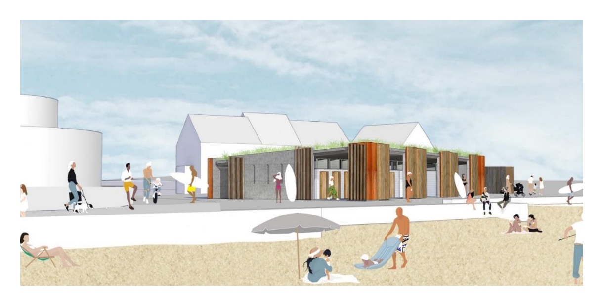
CHIEF EXECUTIVE REPORT PLANNING & DEVELOPMENT ACT, 2000 (AS AMENDED), PART XI PLANNING & DEVELOPMENT REGULATIONS 2001 (AS AMENDED), PART 8