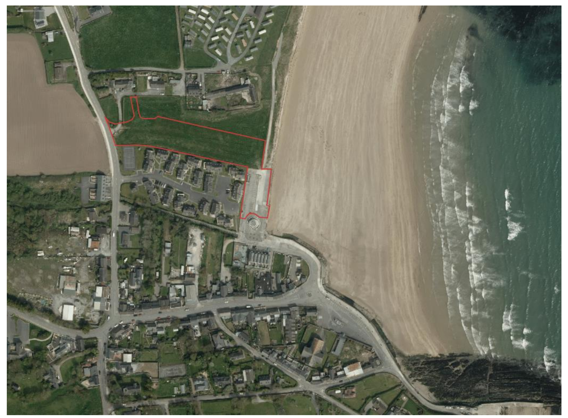
Aerial image of site outlined with red boundary